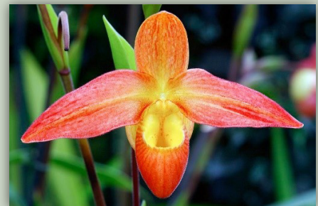
Lady Slipper Orchid