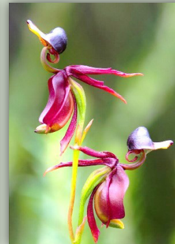
Flying Duck Orchid