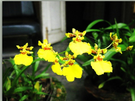
Dancing Lady Orchid