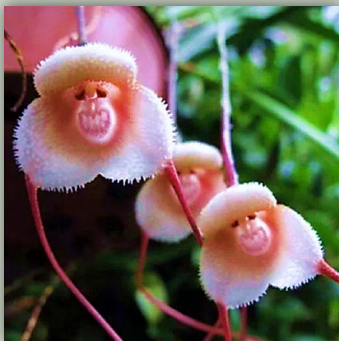
Monkey Face Orchid