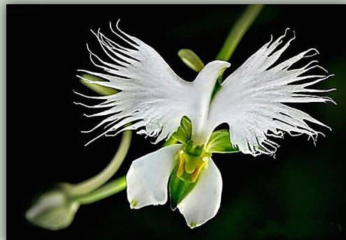
White Egret Orchid