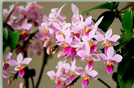
Flying Moths Orchid