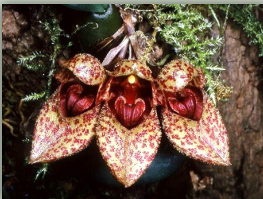
Dutchman's Shoes Orchid