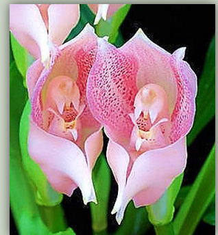
Cradling Baby Orchid